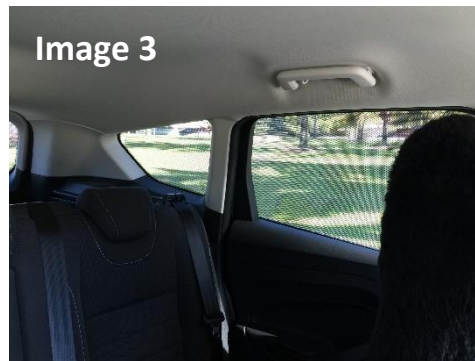
Side Window with One Way Vision (interior view)