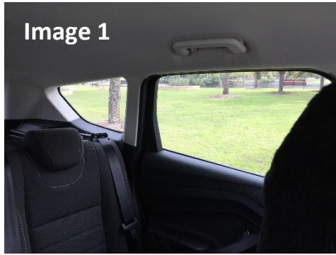
Side Window no One Way Vision