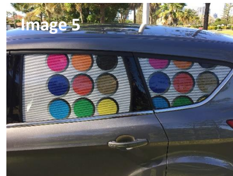
Side Window with One Way Vision (exterior view)